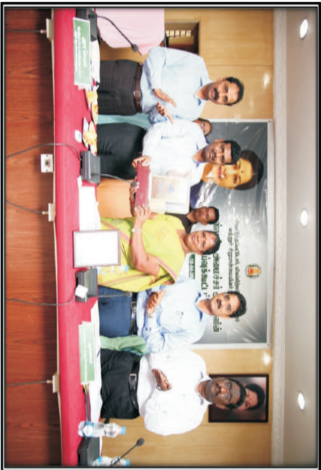
TABCEDCO has been awarded Performance Award (Gold) for the year 2015-16 for it's All India Level best performance