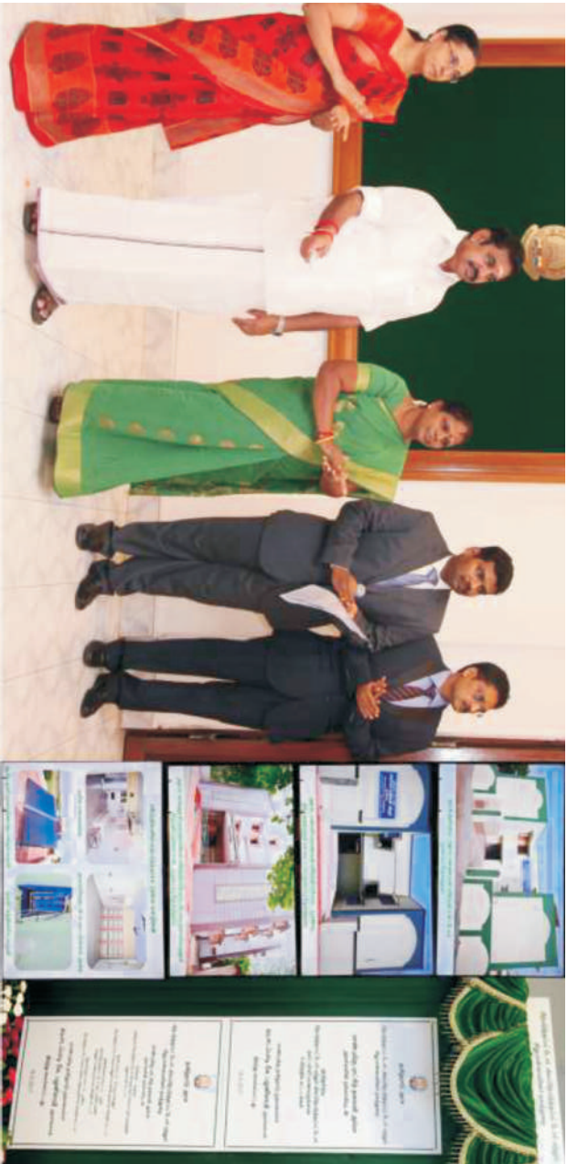
Hon'ble Chief Minister has inaugurated the newly constructed School and College Hostel Buildings on 16.5.2017