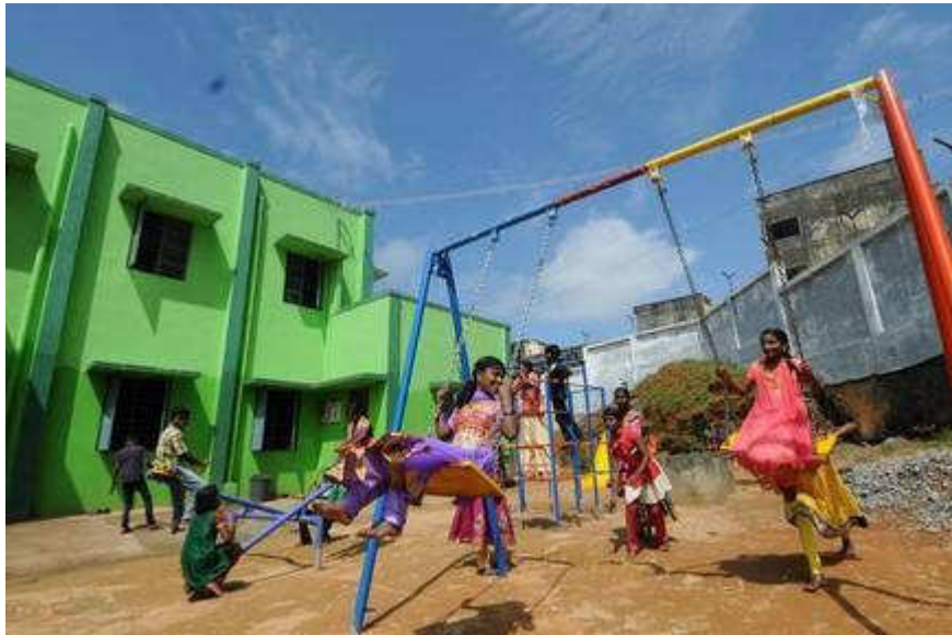
Children from various tribes across Valparai taluk in S.S.A. Nesam Trust residential school for tribal children.